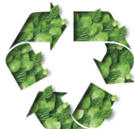
Mattress Recycling Facility - VIC

We embrace our diverse and inclusive workplace, knowing that our diversity is our strength.